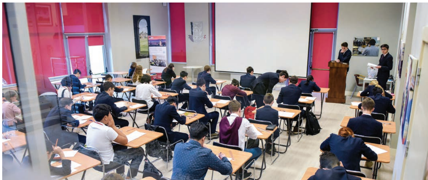
2018 Math Olympiad at Haileybury Almaty